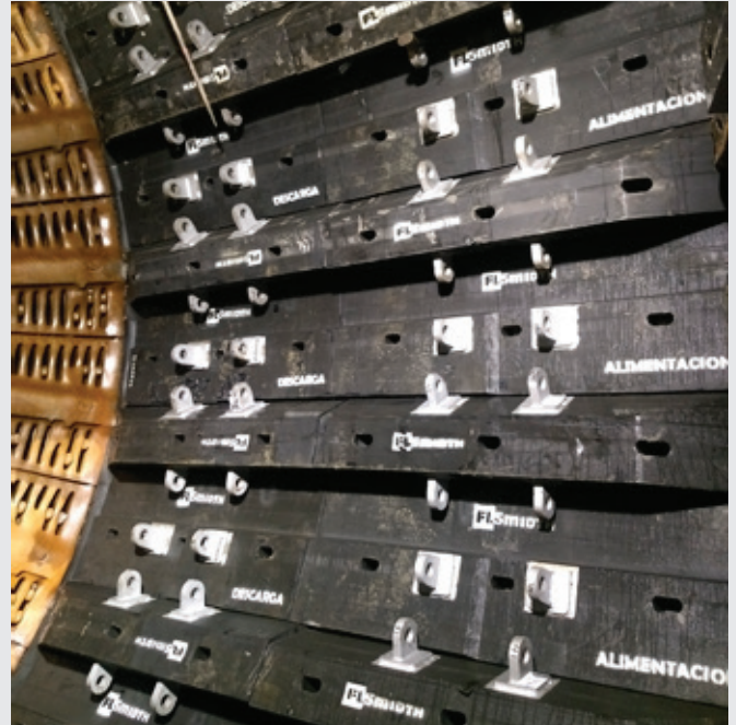
PulpMax Composite Shell Mill Liners

When it comes to optimising the productivity of your operation, quality equipment is only part of the equation. Expert service support and process know-how are also required. We have over 135 years of experience in helping customers discover potential and increase productivity. As a partner invested in your success, we leverage our combination of advanced equipment design, expert service and process know-how to achieve your goals.